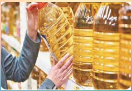
Say No to Rereated Edible Oil!