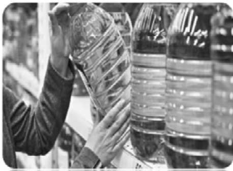
Buy Edible Oil in fixed and limited quantity

To maintain a healthy lifestyle and reduce health risks, follow these simple tips for consuming edible oils