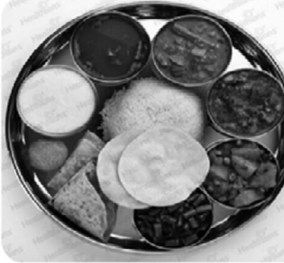
Eat healthy Stay healthy