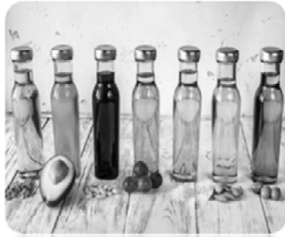
Rotate Different Oils