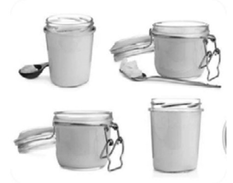
Limit Butter and Ghee