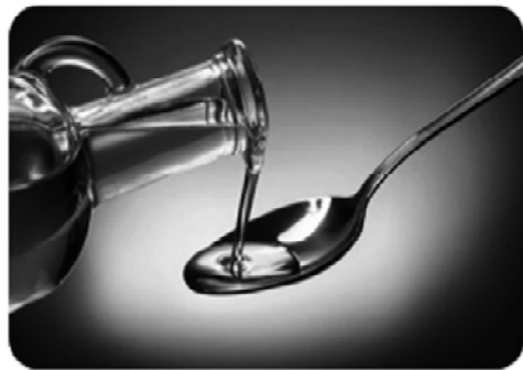
Use Measuring Spoons