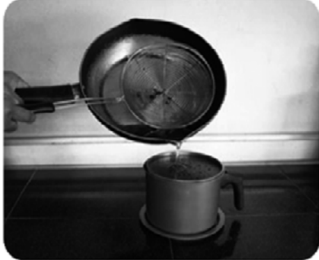
Avoid Reusing Oil