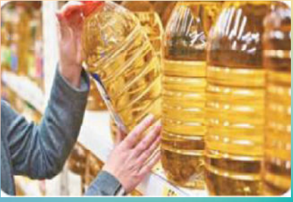
Use less oil for a healthier heart!