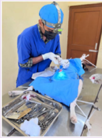
Hospital at Diglipur, a press release from Deptt. of AH&VS said.